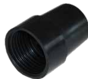
Photo: Screw muff type MUHO

See also brochure page for equipment for reel type HOSR!